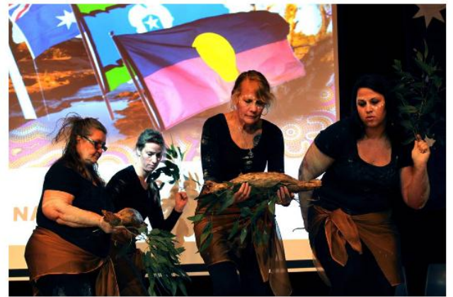
Celebration: Students, staff and special guests take part in NAIDOC week events at Ingleburn High School.

Ingleburn High School last week held a two-day NAIDOC Week celebration, focusing on the sacrifice and achievements of Australia's indigenous war heroes.