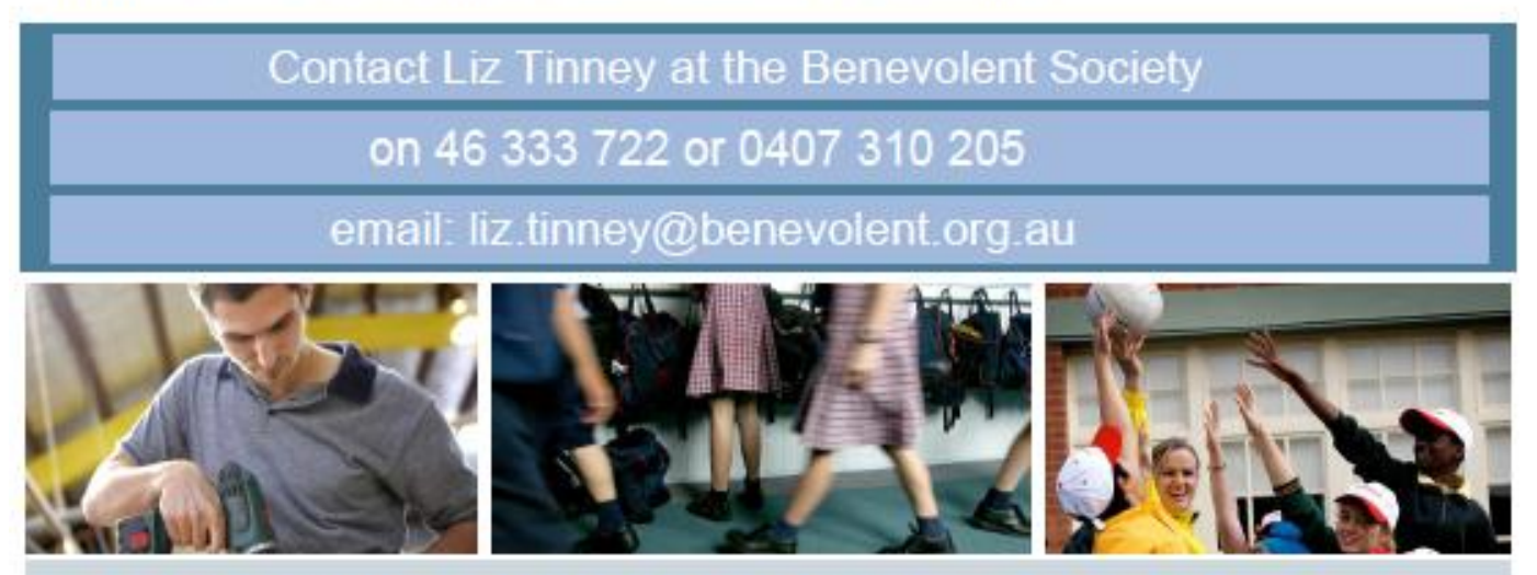
Saver Plus was developed by ANZ and the Brotherhood of St Laurence and is delivered in your local area. The program is funded by ANZ and the Australian Government.

You may be eligible if you have a Health Care or Pensioner Concession Card, are at least 18 years old, have some regular income from work (you or your partner) and have a child at school or study yourself.