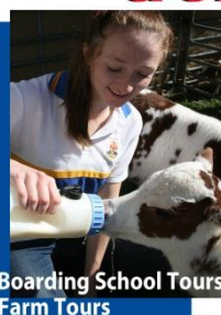
Boarding School Tours Farm Tours

Saturday 31st August 10am to 3pm 50m from Glenfield Railway Station Gold Coin Entrance Fee