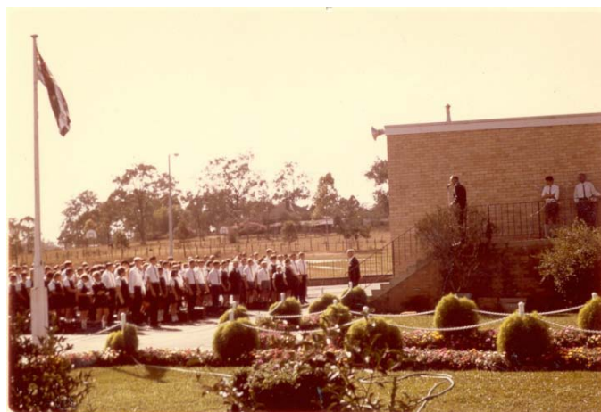
Photo of school assembly before library was built