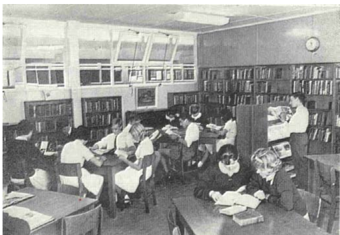
The original library located in present B5

Come along and help make our celebrations a wonderful success