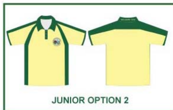
JUNIOR OPTION 2