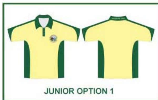
JUNIOR OPTION 1

The following two designs are the options from which you can choose on the survey at the end of this article. One of these options will be chosen after you have given us feedback.