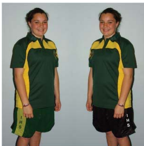
SHORTS OPTION 1

The P&C have been working on a new sports uniform shirt that will be compulsory for all Year 7 2011 and optional for Years 8-12 2011.