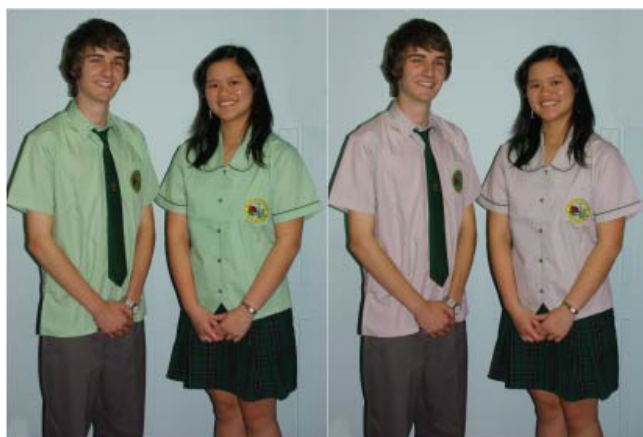
SENIOR OPTION 1